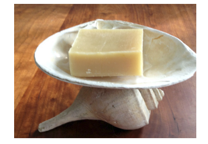
Nantucket Soap Dishes. From the beaches of Nantucket Island our handcrafted soap dishes are made from Surf Clam and Conch shells. An attractive addition to any bath. Only $8.95

Our new festive holiday coasters will make a great stocking stuffer. We have four different styles available. The round ones are the heavy duty stone variety with a cork underside, and the square ones are made from thick printed stock mounted on a durable cork backing. Guaranteed to protect the finish of your table from a careless party guest. Of course, no guarantees regarding collateral damage caused by battling the dreaded Flashlight Monster. Starting at Only $4.95.