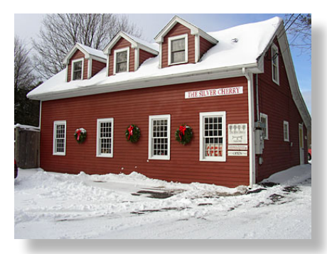
The Silver Cherry Holiday Hours Tuesday - Friday 11:00 AM - 4:00 PM Saturday 10:00 AM - 5:00 PM Sunday 11:00 AM - 3:30 PM Close Mondays

We will feature our famous Welch Rabbit, soups from our 2011 Silver Cherry Soup Cookbook, plus our famous non award winning Chili. Come-on in, get warm and have some great food, and see what's new at The Silver Cherry.