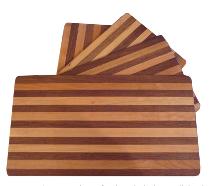
Cutting Boards. Hand-crafted, solid cherry/black walnut cutting boards measure approximately 10" x 18" Only $28.00.