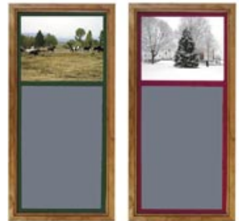
Wyoming Wild Horses

To find out more information about our custom mirrors, or purchase one of our own mirrors go to www.redway.com/mirrors