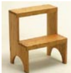
The Redway Shaker Step $225.00

Tuesday - Friday 11:00 AM - 4:00 PM Saturday 10:00 AM - 5:00 PM Sunday 11:00 AM - 3:30 PM Close Mondays