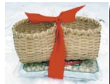
Peanut And Pistachio Baskets

Fill one side with the supplied peanuts or pistachios, and discard the shells on the other side.